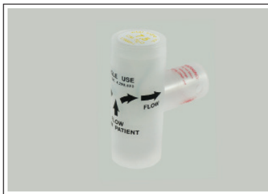
Over pressure valve