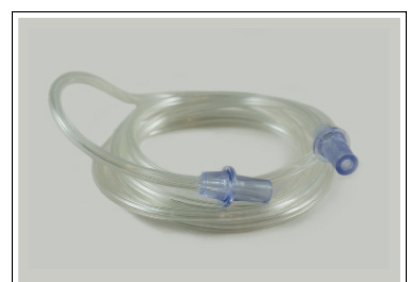
Oxygen supply tube