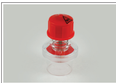
Disposable PEEP Valve