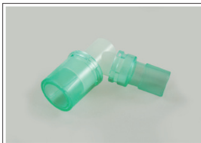
Double swivel elbow 15M-22M/15F