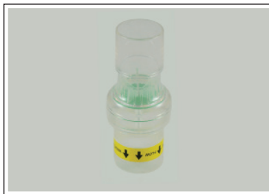
One way valve 22M x 22F