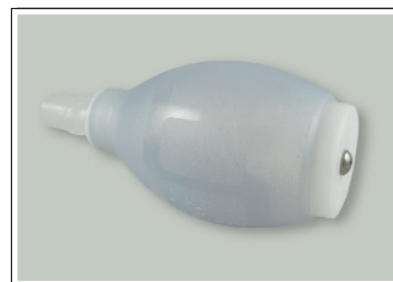
Paediatric self-inflating bag