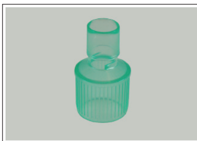
Straight connector 22F - 15M