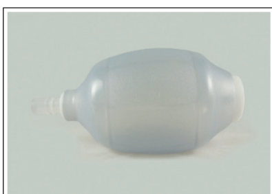
Adult self-inflating bag