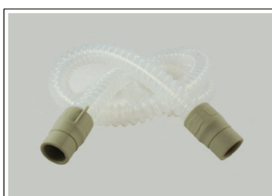
Single silicone tube Adult 1.2m