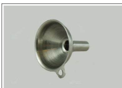
Mini funnel for vaporiser