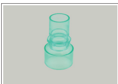
Scavenger connector 22m x 30 F