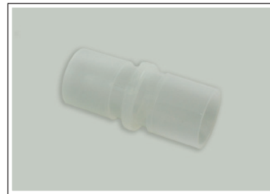
Straight connector 22M x 22M