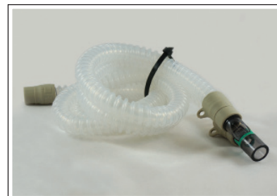
Adult patient circuit (2 x tubes and Y piece)