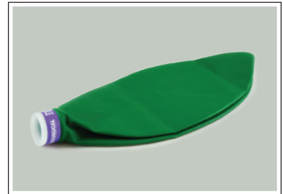
2 litre reservoir bag