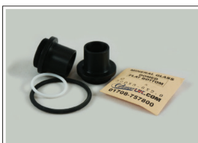
Vaporiser service kit