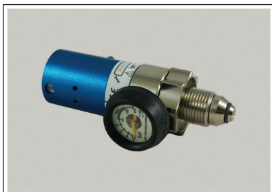
Oxygen cylinder pressure regulator