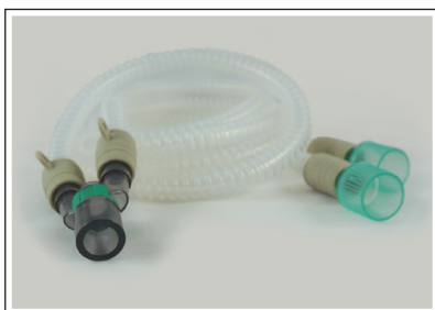
Paediatric patient circuit (2 x tubes and Y piece)