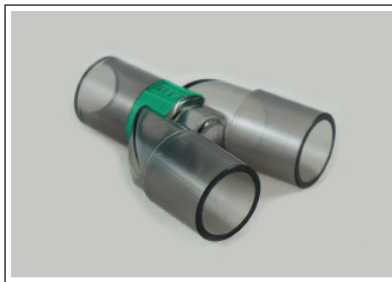
Adult Y piece for circuit