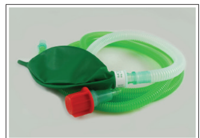
Ayres T piece paediatric circuit