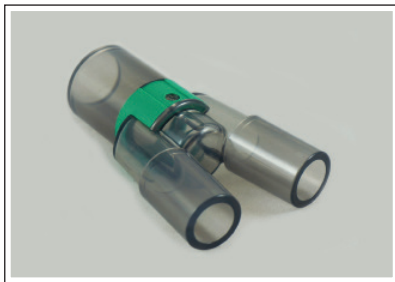
Paediatric Y piece for circuit