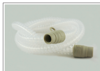
Single silicone tube Paediatric 1.2m